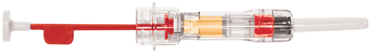
ZOLADEX 3.6 mg syringe - For illustration only.